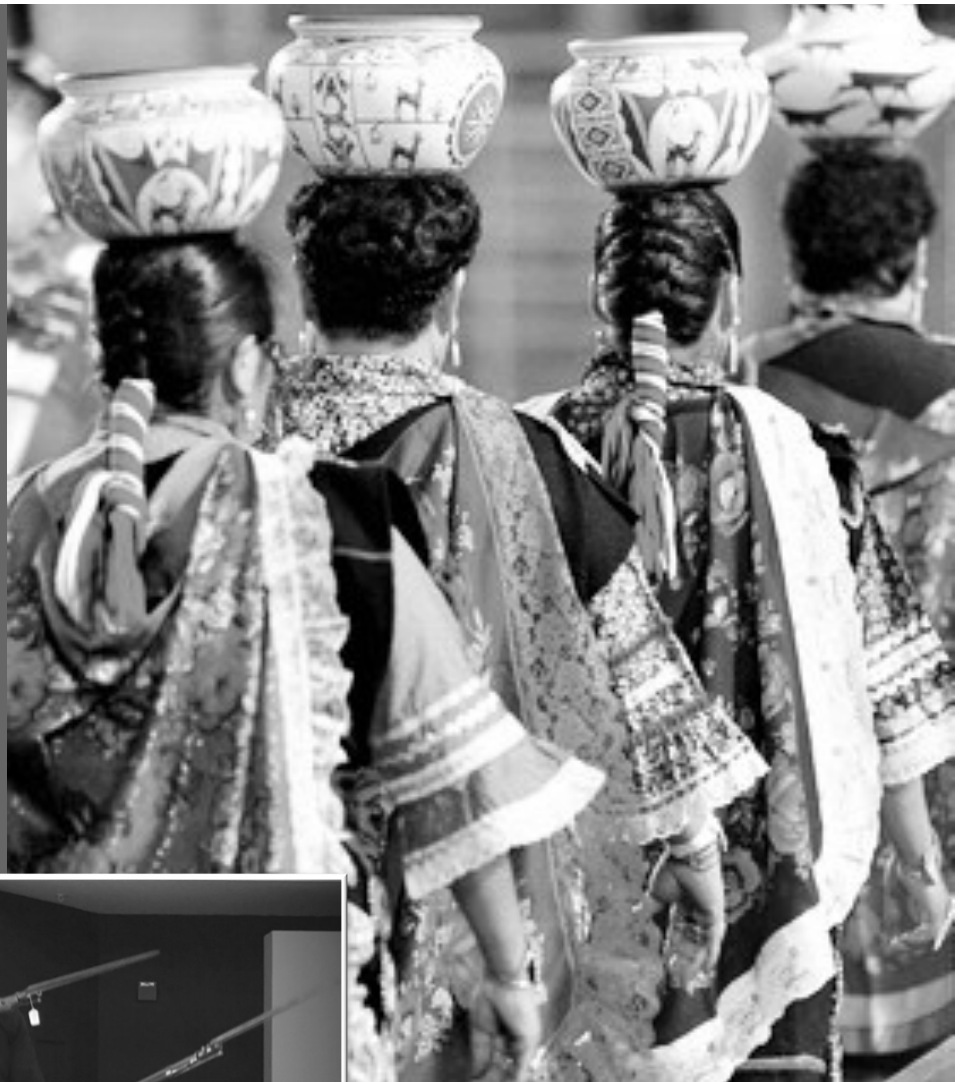
Zuni Olla dancers balance ceramic pots on their heads.

We had many amazing speakers and presenters discussing a wide range of topics ranging from Civil War weapons and tactics to getting at-risk students engaged in American History to how our local Albuquerque Museum is pioneering new ways to engage students.