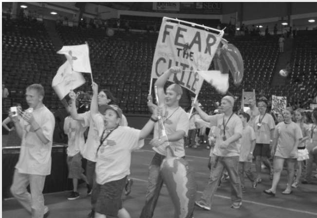
National History Day Parade of States 2010, University of Maryland.

Would you like to get your students involved in next year's competition? 2015-2016 theme is Exploration, Encounter, and Exchange in History. Check out the National History Day website for more information, www.nhd.org .