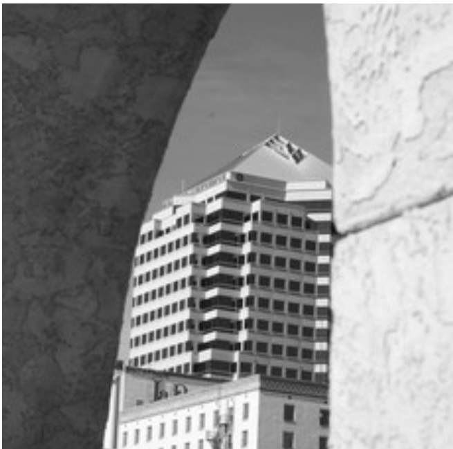
Bank of Albuquerque as seen through an archway in Downtown ABQ.