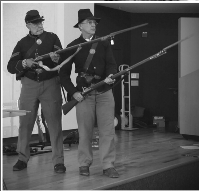
Civil War historians shared weapons and tactics to an audience of social studies teachers at this year's NMCSS conference.